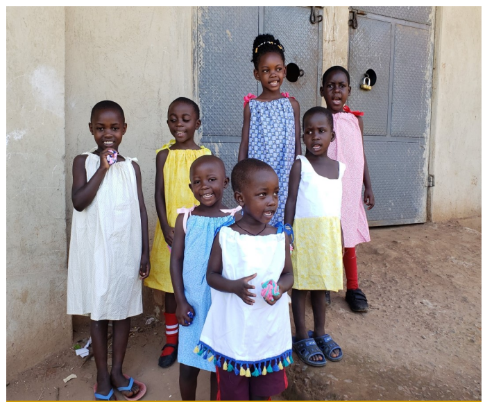
Zirobwe village happiness