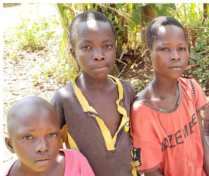
SCHOLARSHIP RECIPIENTS by individual sponsors 3