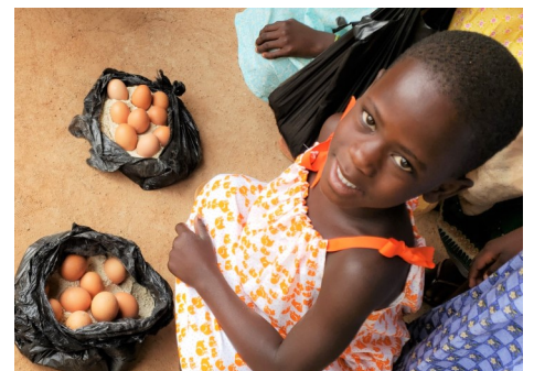
This girl in Ajiija village, 37 miles east of Kampala, is ready with her starter chicken feed can’t wait to eat eggs

One project at a time One family at a time One child at a time One step at a time and One egg at a time