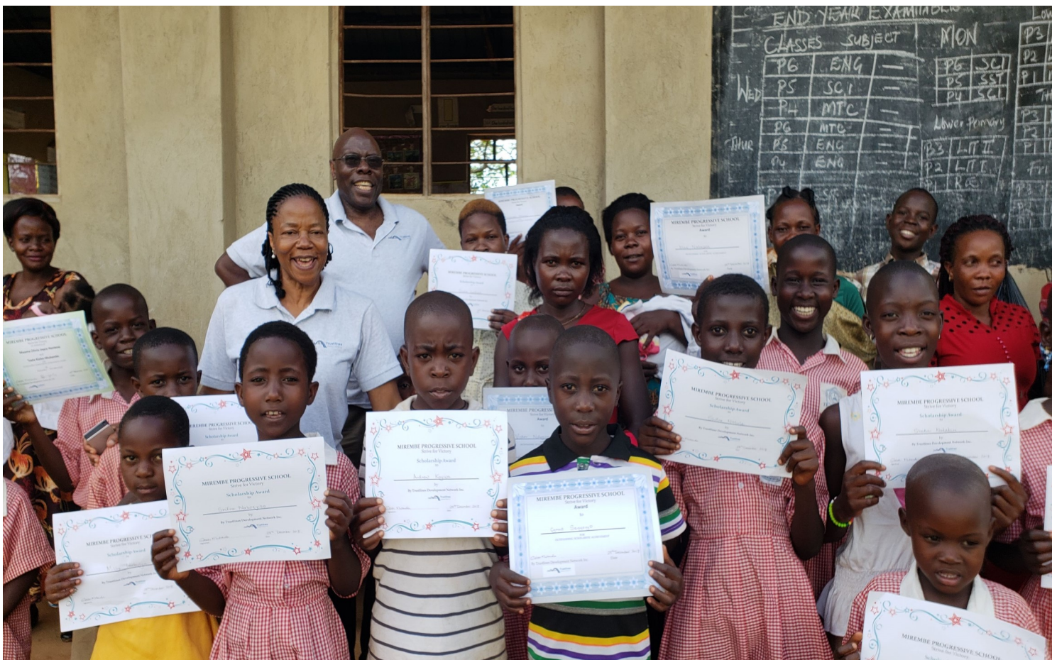
TOP: the 18 one-term and two one-year scholarship recipients BOTTOM: four one-year recipients